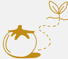
INGREDIENT TRACEABILITY P. 62